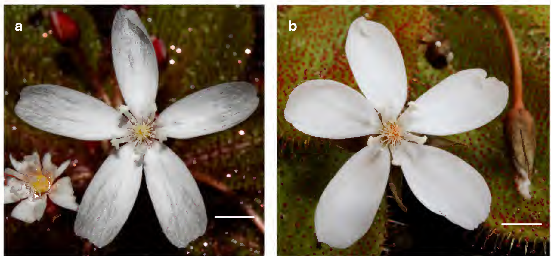
Fig. 1. Open flowers of a , D. bulbosa subsp. bulbosa and b , D. bulbosa subsp. major that show the flowers have white pollen and capitate styles that form a hemispherical dome around the apex of the ovary. Scale bar: a & b = 5mm.

Affinities: Based on leaf shape, leaves with a prominent raised midrib, flowers held singularly on their own pedicels and capitate stigmas, and preliminary molecular data this taxon is most closely allied to Drosera bulbosa subsp. bulbosa and D. bulbosa subsp. major . It is intermediate in size between these two subspecies and due to its pollen colour and the absence of style segments from the apex of the ovary it is hereby considered to be another subspecies of D. bulbosa . Subspecific rank appears appropriate due to the similar leaf morphology of the three subspecies, all with their prominent raised midrib on the adaxial surface, and also the similarity of molecular sequences (unpublished data, not present here). Characteristic features of these subspecies are provided in Table 1 below. The type collection for D. bulbosa subsp. major was made near the town of Mingenew